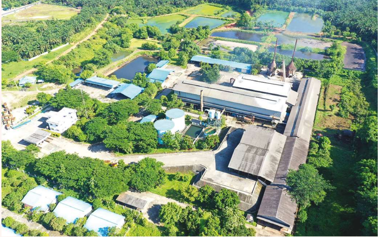
Acquired third milling plant in Riau, Indonesia on 3 April 2023.

We market and distribute a range of other FMCG products such as rice, cashew, food premixes and soap to more than 100 countries through a well-established global sales and distribution network, supported by our wide range of brands including our flagship brands OKI and MOI brands. We will continue to explore more consumer products that can be sold as a basket of products to our existing and prospective customers.